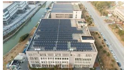
Giving buildings an "MRI" to make them more energy-efficient and

Utility-scale front-of-meter projects controlled 70.63% of the 2025 energy storage market size, underpinned by renewable-integration mandates