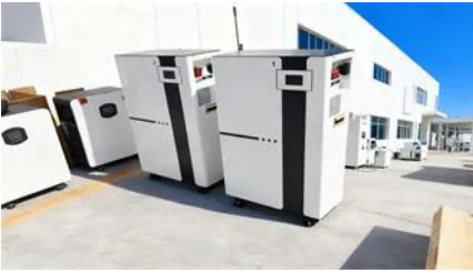
High Voltage Box in Energy Storage Systems.Industry.SolarMak

What is a High Voltage Box in Energy Storage Systems? A high voltage box, often referred to as a high-voltage distribution cabinet, is an essential component in containerized energy