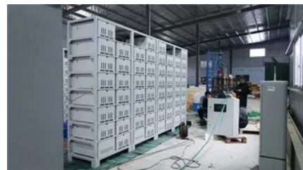
ABB has responded to rapidly rising demand for low and zero emissions from ships by developing Containerized ESS - a complete, plug-in solution to install