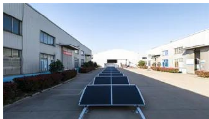
Liquid Cooling Battery Cabinets 100Kw 215Kwh 200Kw 372Kwh

100kW/215kWh outdoor integrated cabinet for industrial and commercial storage. Suitable for various industrial and commercial application scenarios such as industrial parks and commercial complexes,