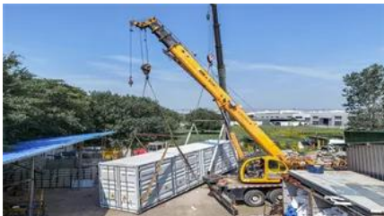
What are microgrids - and how can they help with power cuts?

Microgrids can step in when the main electricity grid fails. And as they can be powered by renewables, they are a sustainable and affordable option, too.