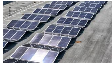
Optimal capacity determination of photovoltaic and energy storage

Simultaneous capacity configuration and scheduling optimization of an integrated electrical vehicle charging station with photovoltaic and battery energy storage system