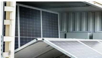
A review of solar photovoltaic technologies: developments, challenges

Solar photovoltaic (PV) technology has emerged as a key renewable energy solution, yet its widespread adoption faces several technical and economic challenges.