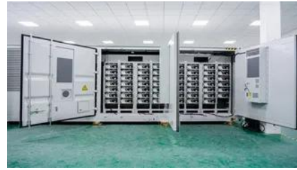
Small: Early View

A new nanoparticle-based biomarker panel is described that can differentiate pancreatic cancer from benign pancreatic disease with a high level of performance. This was enabled by microelectrode