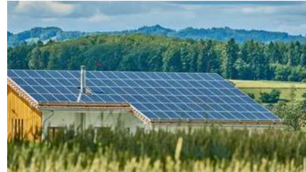
ABB offers a comprehensive range of reliable and high efficiency power protection solutions. Making sure you have a reliable supply of power for your critical