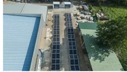
Communication base station solar and wind power generation

Discover how hybrid energy systems, combining solar, wind, and battery storage, are transforming telecom base station power, reducing costs, and boosting sustainability.